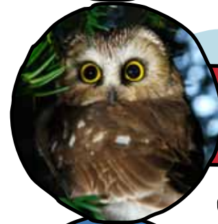
NORTHERN SAW-WHET OWL